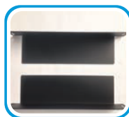
19" RACK SHELVES