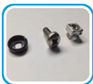
SCREWS, WASHERS & CAGED NUTS