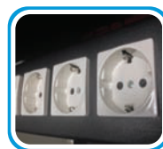
CABLED POWER OUTLETS